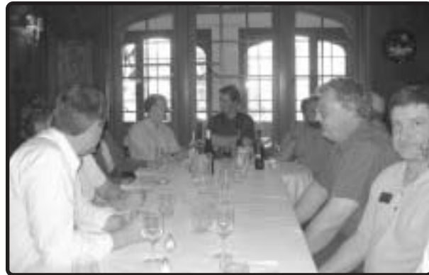
The group enjoys a lunch together

On May 13, 2004 the semi-annual CVO/OVMA Liaison Meeting, hosted by the CVO, was held at Green Gables Executive Guest House in Kitchener. The Liaison Meeting included the executive of each organization. Meetings are hosted alternately by CVO and OVMA.